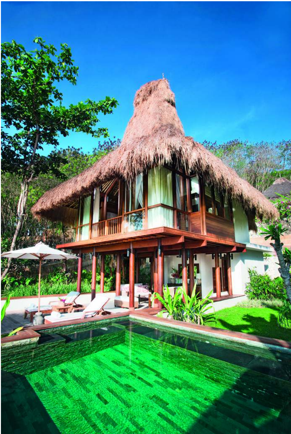
Tropical style meets beach chic at the Nihi Sumba, with traditional grass-thatched menara roofs, open lounges and teak wood.

Located a 50-minute flight away from Bali, the island of Sumba is home to this award winning luxury resort with 38 rooms spread across 27 luxurious villas. There is a 2.5-km-long private beach that features an amazing surf break, as well as a range of wellness-focused activities like the indulgent Spa Safari which treats guests to all-day unlimited spa treatments. Apart from beautiful sights and high-living experiences, Nihi Sumba also offers guests a chance to do their part for the local economy by simply staying at the resort. It creates many jobs for the islanders—as the Sumbanese account for over 90 percent of their staff, the resort is by far the biggest employer on the island. Nihi Sumba also contributes a portion of its profits to the Sumba Foundation, to build medical clinics and water wells, refurbish schools and provide lunches for under-nourished children on the island.