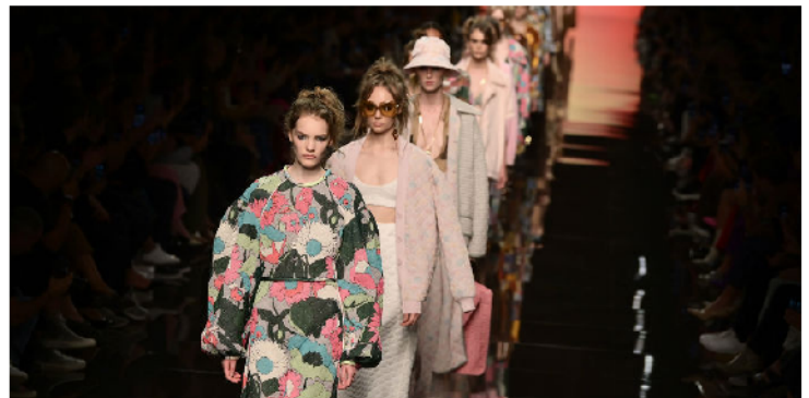
Milan Fashion Week: 10 Best Looks From Fendi Spring/Summer 2020 ( https://www.harpersbazaar.com.sg/fashion/milan-fashion-week-10-best-looks-fendi-spring-summer-2020/ )