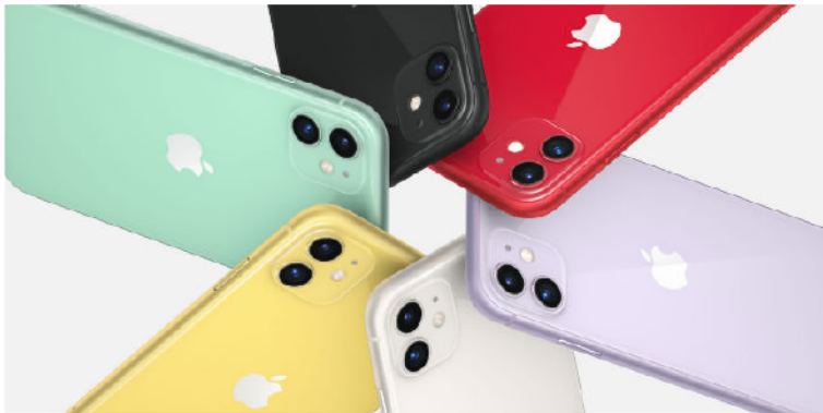
Your First Look At All Of The Newest Apple Game-changers ( https://www.harpersbazaar.com.sg/life/first-look-at-newest-apple-game-changers/ )

Jewels & Watches ( https://www.harpersbazaar.com.sg/category/watche: