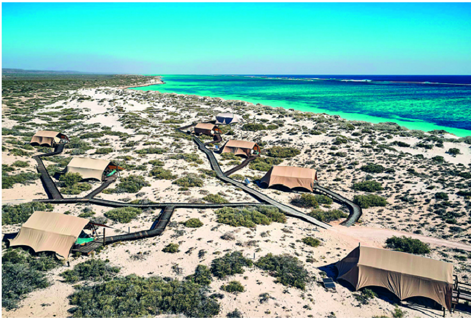
Sal Salis' untouched location offers guests the rare opportunity to truly get away from it all.

For a true luxury glamping experience, the Sal Salis eco-resort provides the perfect opportunity to explore the World Heritage-listed Ningaloo Reef. The exclusivity of the resort comes from its restricted capacity—there are only 15 pavilions—as well as its unique location. Offering spectacular ocean views from its position on a remote stretch of Western Australia's Ningaloo coast, Sal Salis offers guests opportunities to swim with whale sharks, humpback whales and dugongs. Not surprisingly, the resort is firmly committed to preserving the beautiful reef and wildlife, generously supporting Western Australia's Department of Biodiversity and Conservation. Their top-notch eco-credentials also come from an extensive use of solar panels as well as a big push to minimise water and material waste, all to protect Australia's precious natural heritage.