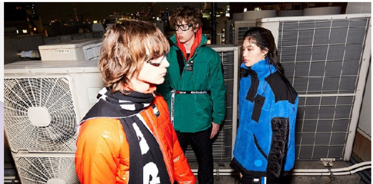
Introducing Onitsuka Tiger's FW19 Collection ( https://www.harpersbazaar.com.sg/fashion/onitsuka-tiger-fall-winter-2019-collection/ )