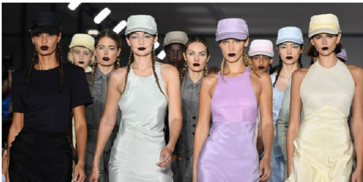
Milan Fashion Week: 10 Best Looks From Max Mara Spring/Summer 2020 ( https://www.harpersbazaar.com.sg/fashion/milan-fashion-week-10-best-looks-max-mara-spring-summer-2020/ )