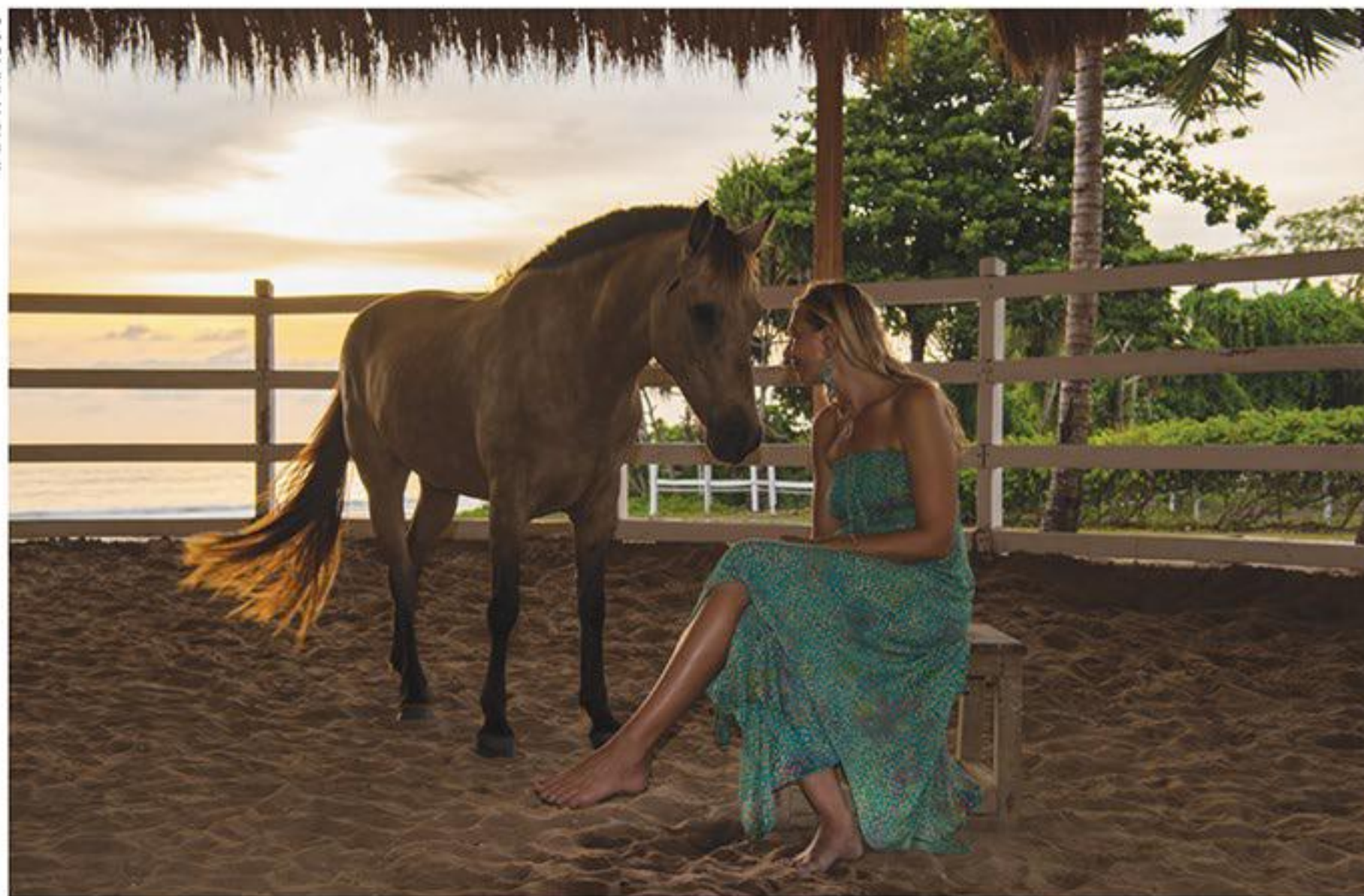
An island pony takes part in an equine meditation session with a guest.

Pasola , horseracing, buffalo washing, music and dance, along with delicious culinary delights. After a fireworks display, festivities lasted late into the night.