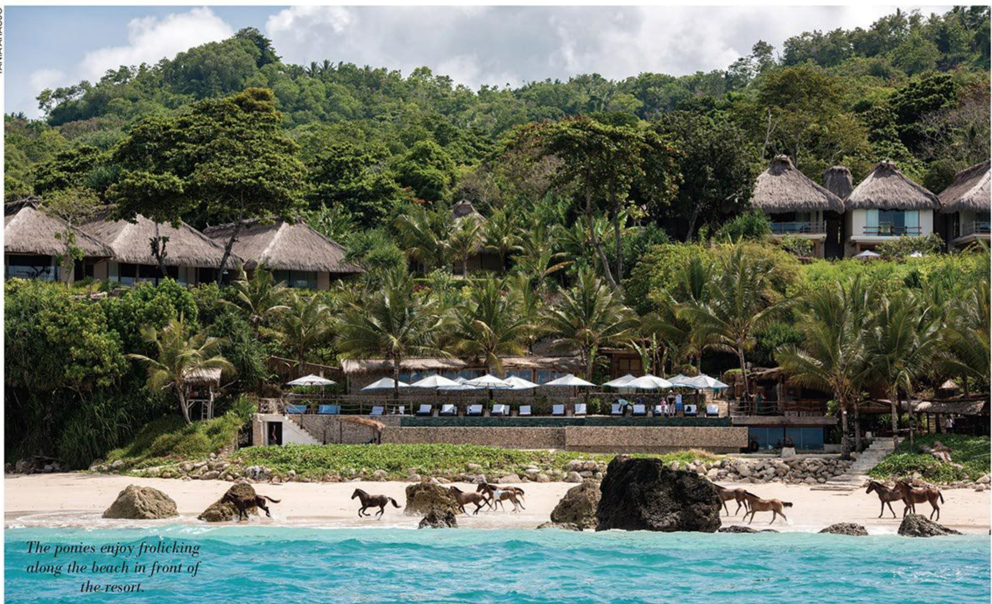
The ponies enjoy frolicking along the beach in front of the resort.