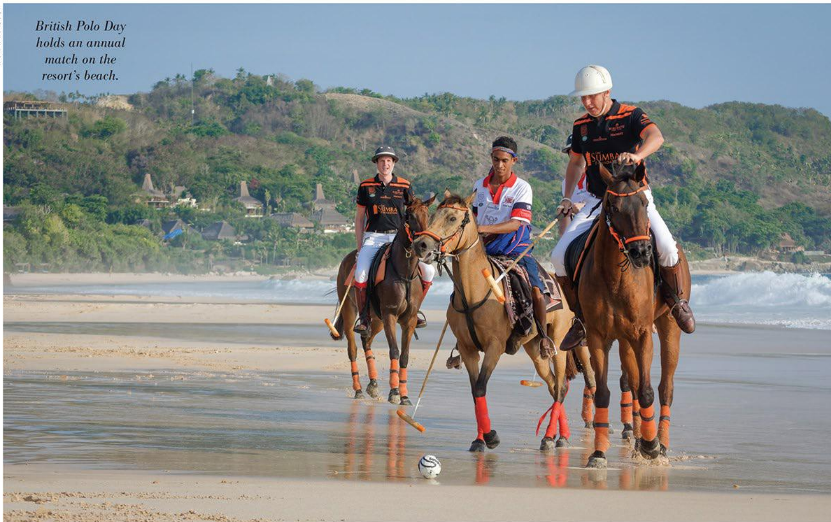
British Polo Day holds an annual match on the resort's beach.