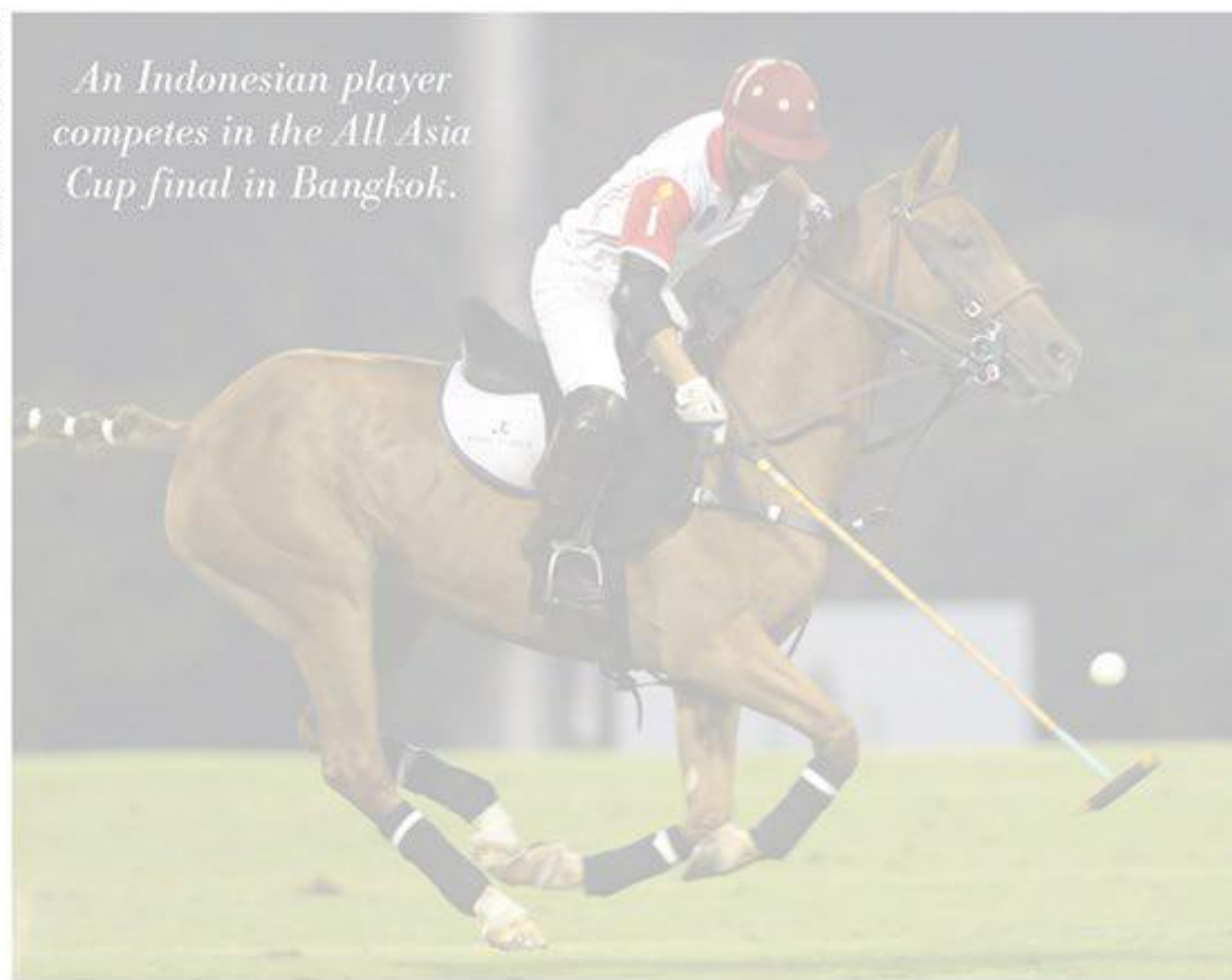
An Indonesian player competes in the All Asia Cup final in Bangkok.