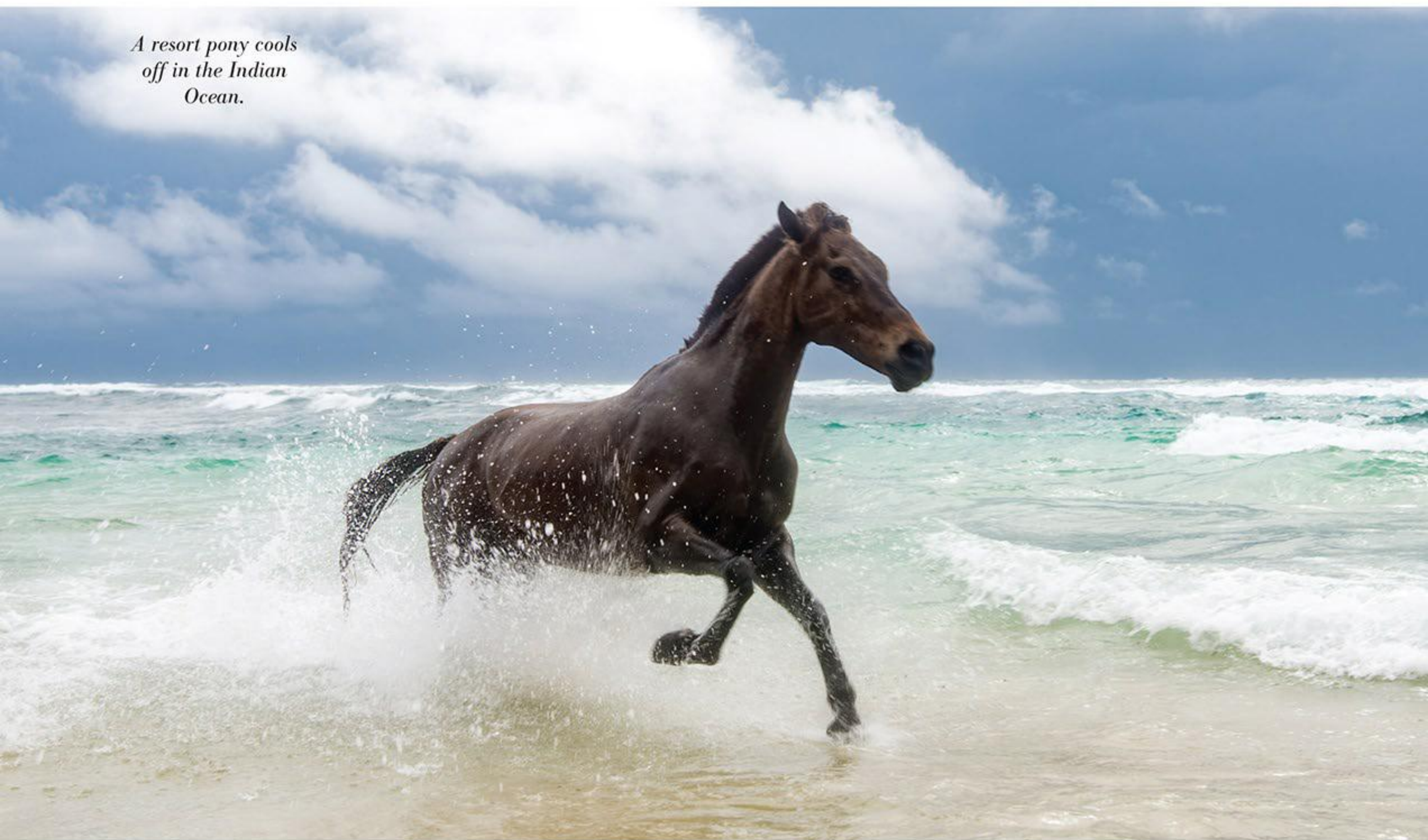
A resort pony cools off in the Indian Ocean.