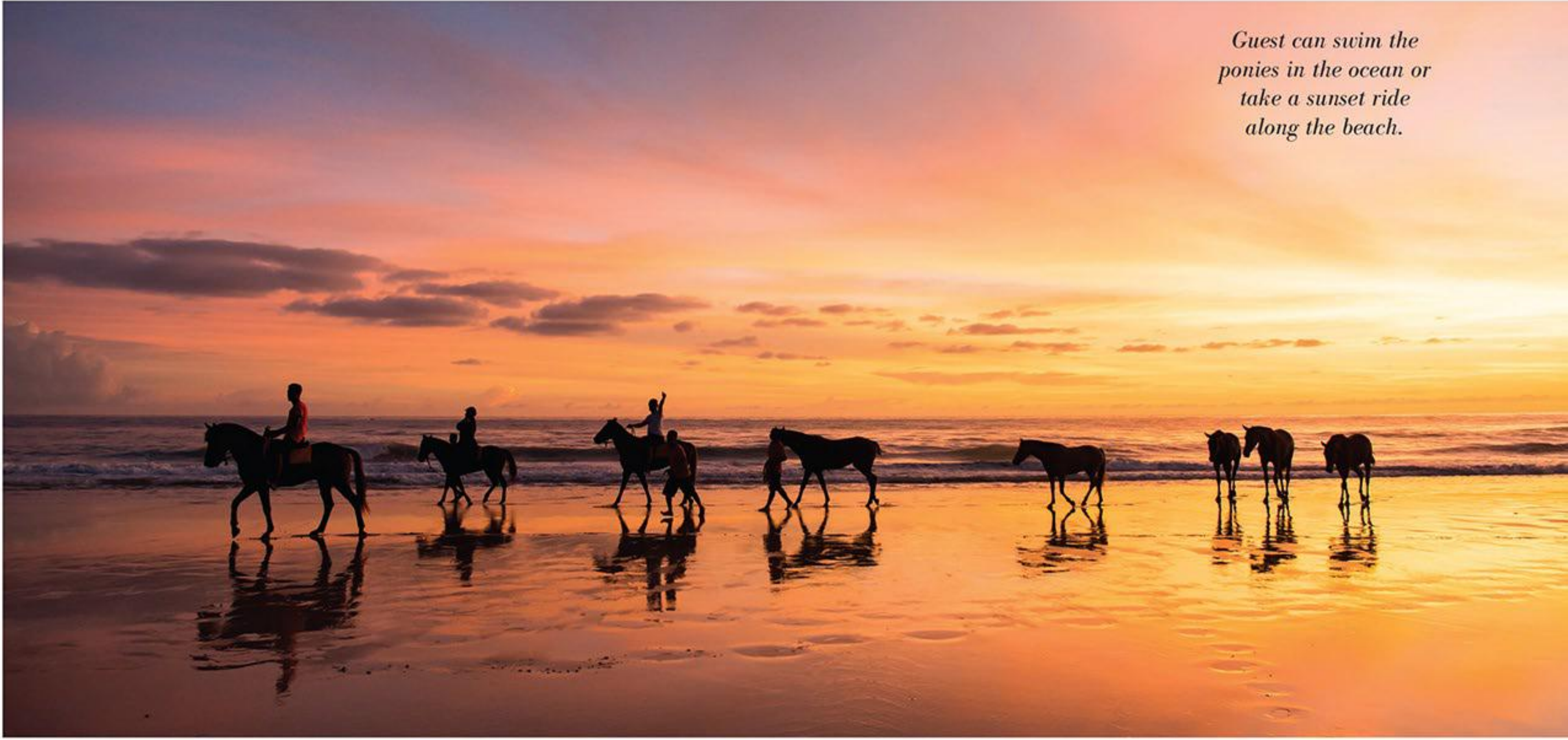
Guest can swim the ponies in the ocean or take a sunset ride along the beach.